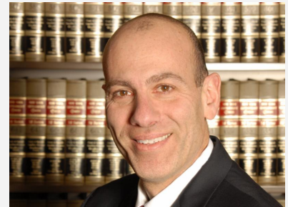
James G. Dibbini & Associates, P.C.